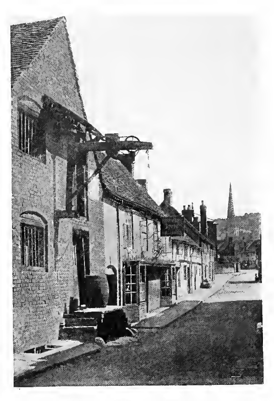
Down Bye Street, in a little Shropshire town, There lived a widow with her only son: She had no wealth nor title to renown, Nor any joyous hours, never one.